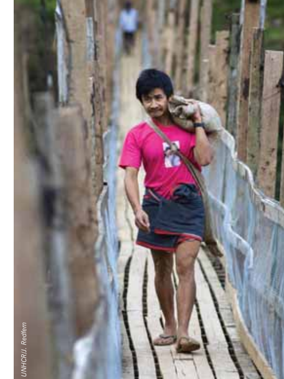
Mae Ra Ma Luang refugee camp in Thailand straddles a river flanked by steep hillsides — bridges are needed to cross from one side of the camp to the other.

UNHCR led a major effort in data management, with primary emphasis on the northern Rakhine State. This included a village tract survey in 191 villages and a household survey covering 785 sample households. UNHCR's quick-impact projects proved of immediate value to those communities that benefited from the construction or rehabilitation of 14 primary schools, ten rural health centres, 49 water wells and three rural bridges.