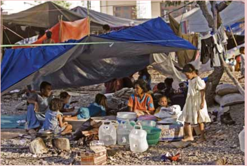
Timor-Leste: Many IDPs fled their homes and settled in a makeshift camp near the port in Dili.

UNHCR was involved in improving IDP camps in the capital Dili and its outskirts. Interventions were undertaken in close coordination with the International Committee of the Red Cross and other agencies operating in and around the capital. UNHCR reduced its involvement in the distribution of emergency shelter and non-food items in July and August as needs were alleviated.