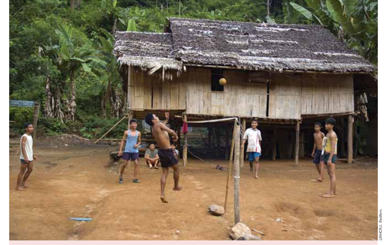
Some 140,000 refugees from Myanmar live in nine refugee camps in Thailand. Many have lived in camps for almost two decades.

refugee camps. Although the students are not allowed to work in Thailand, the value of this programme in the event of resettlement or repatriation is recognized. Participatory assessments have shown the strong need for courses in the Thai language, which were provided.