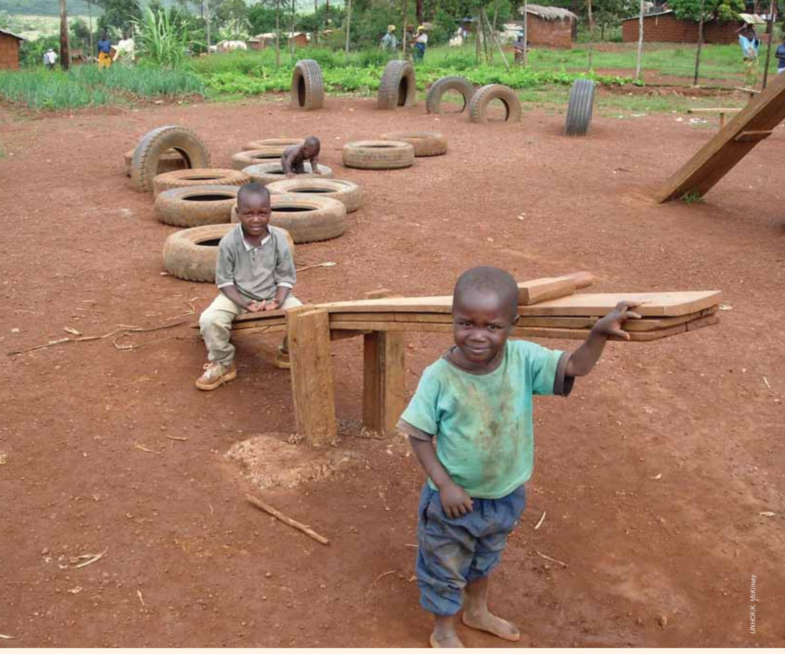
This children's playground in Lukole camp was made from recycled wood and tyres.

target those with special needs and/or in need of resettlement.