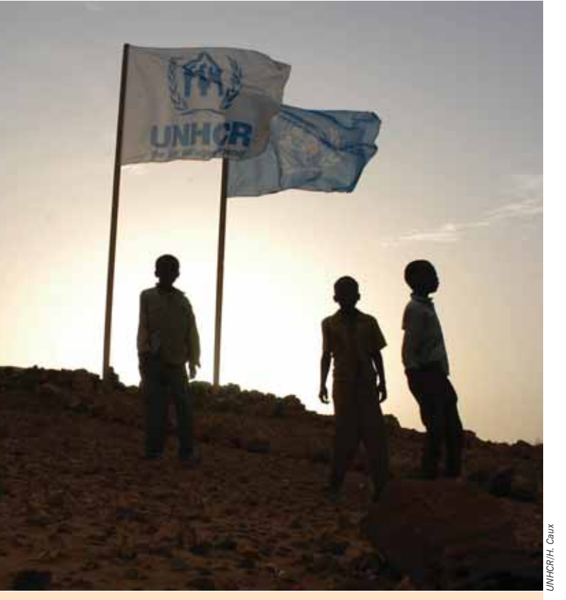
Sudanese refugees from Darfur.

The Chad operation requires sufficient financial support if it is to maintain current levels of protection and assistance to refugees and IDPs, especially in view of the logistical difficulties. Resources will also be needed to relocate some camp sites.