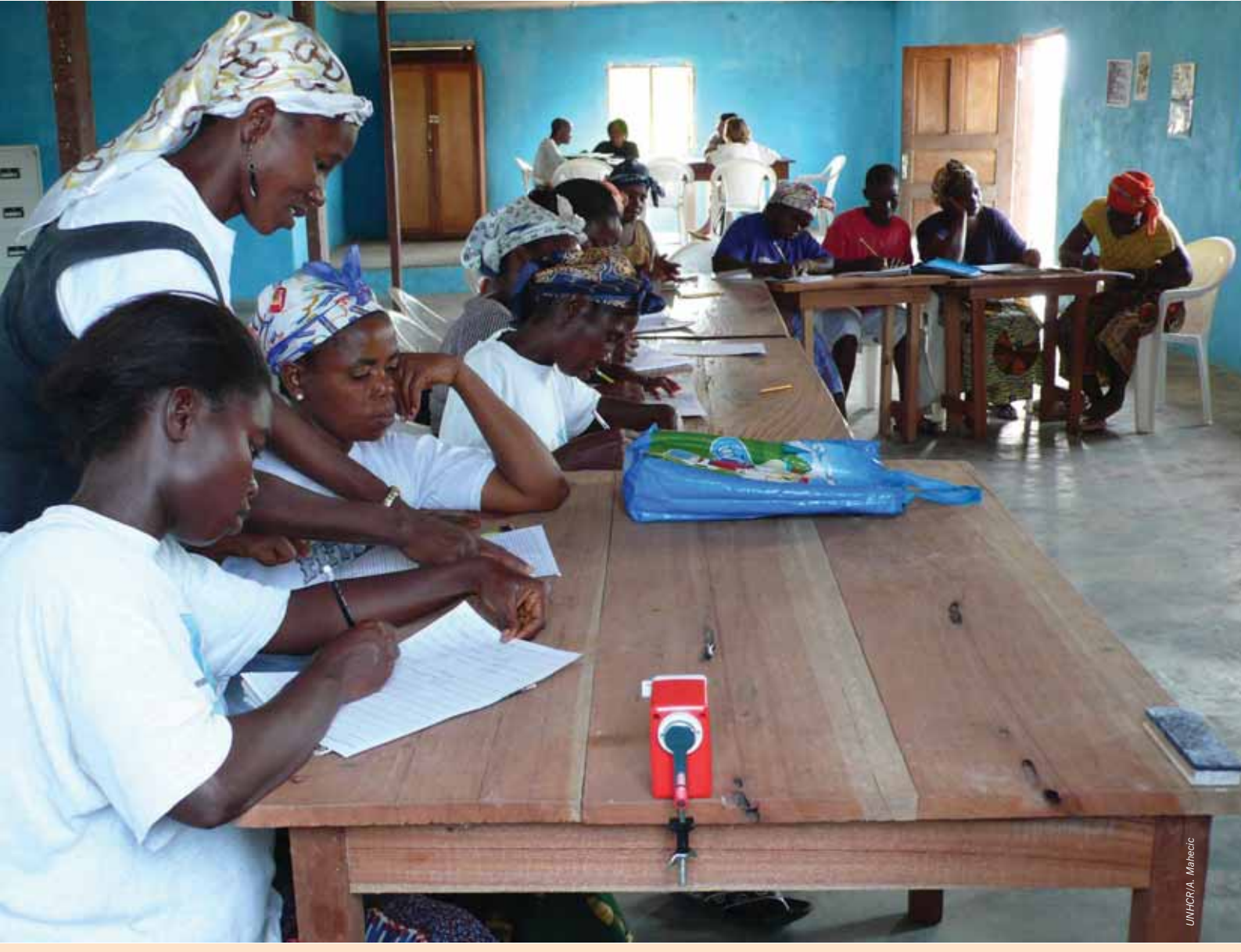
UNHCR-funded Suakako Women's Centre in Bong County, where returnees can attend literacy and tailoring classes.