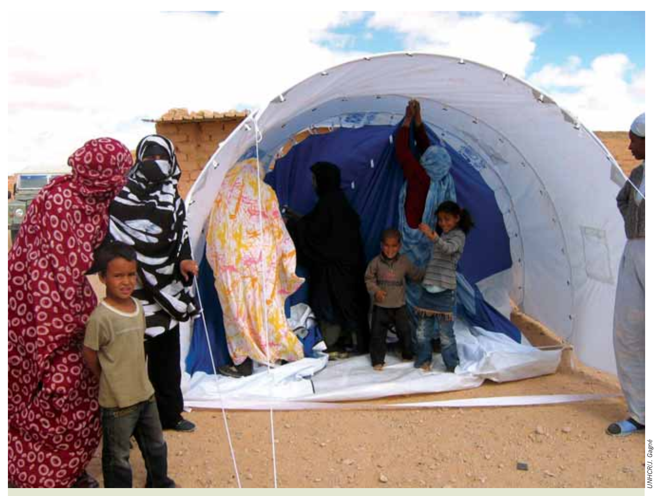
Asmara camp, Western Algeria. UNHCR airlifted emergency supplies for more than 50,000 Sahrawi refugee flood victims.

programmes for adolescents. The project will ensure the provision of potable water and adequate sanitation in all camps.