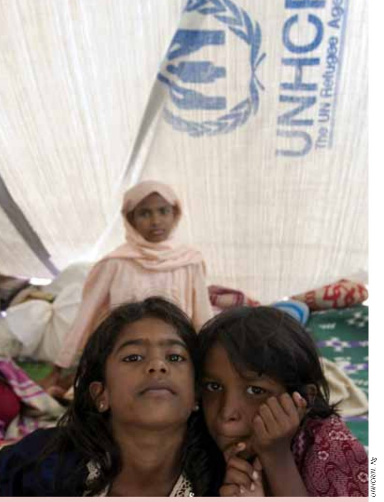
Sri Lanka. IDP children in a tent fashioned out of UNHCR canvas in Kantale.