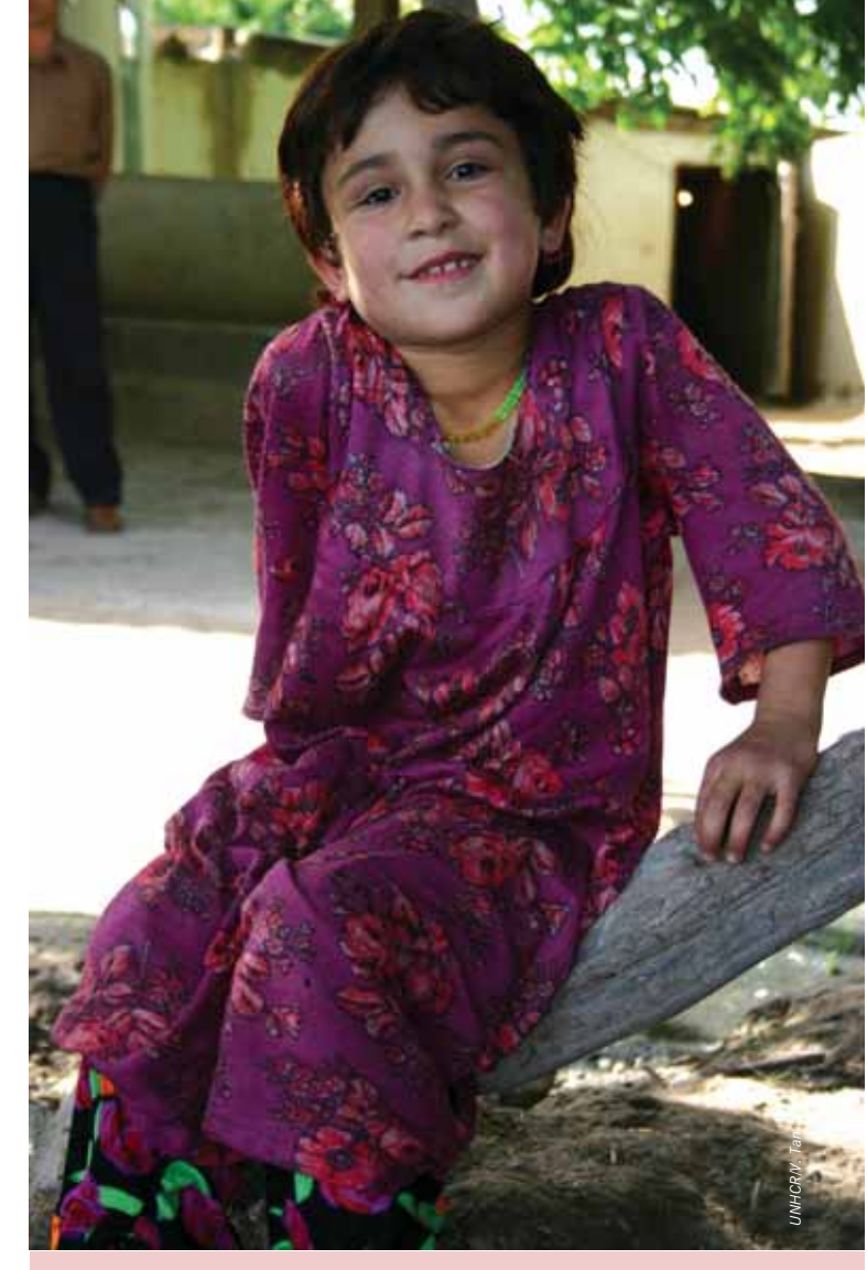
Young returnee in Rohi Nav village, Vaksh district, Kazakhstan.

Participatory assessments will help the Office identify and address the specific needs of the most vulnerable groups, especially women and children. Gender and age considerations will be mainstreamed into all UNHCR programmes.