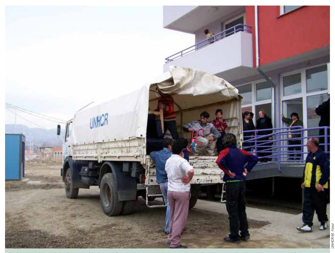
Serbia. Members of the Roma, Ashkalia and Egyptian communities move into new apartments in Mitrovica, province of Kosovo.

candidate-country status. Likewise, UNHCR will seek to prevent and reduce statelessness through providing legal support for individual cases and technical expertise to governments.