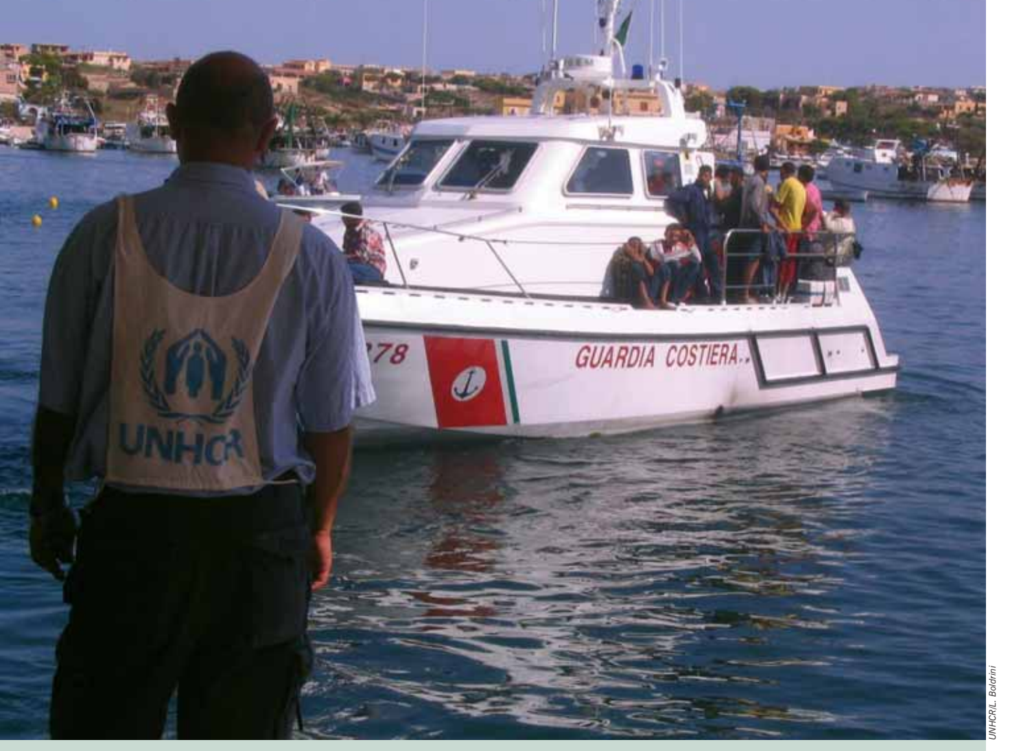
Italy. Arrival of boat people whose craft was intercepted by the Italian coast guard off of the coast of Lampedusa.

In Italy, UNHCR works with the Central Service for the Protection of Asylum-Seekers and Refugees and the National Association of Municipalities to enhance the integration of recognized refugees, especially those with specific needs such as victims of torture or unaccompanied minors. The Office is maintaining a mobile team on the coast of Sicily while working to handover monitoring tasks to local partners. UNHCR will also work to combat racism and xenophobia, which affect the Roma communities, immigrants and asylum-seekers of African origin.