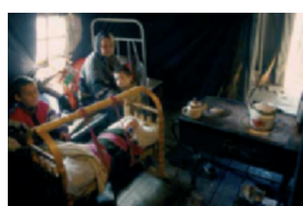
Russian Federation / Ingushetia / Chechen IDPs / A grandmother minds her children in a tented camp in Sunzhenski District / UNHCR / T. Makeeva / March 2003

Lack of adequate housing during displacement is often related to lack of access to other rights, such as water, sanitation facilities, and health care.