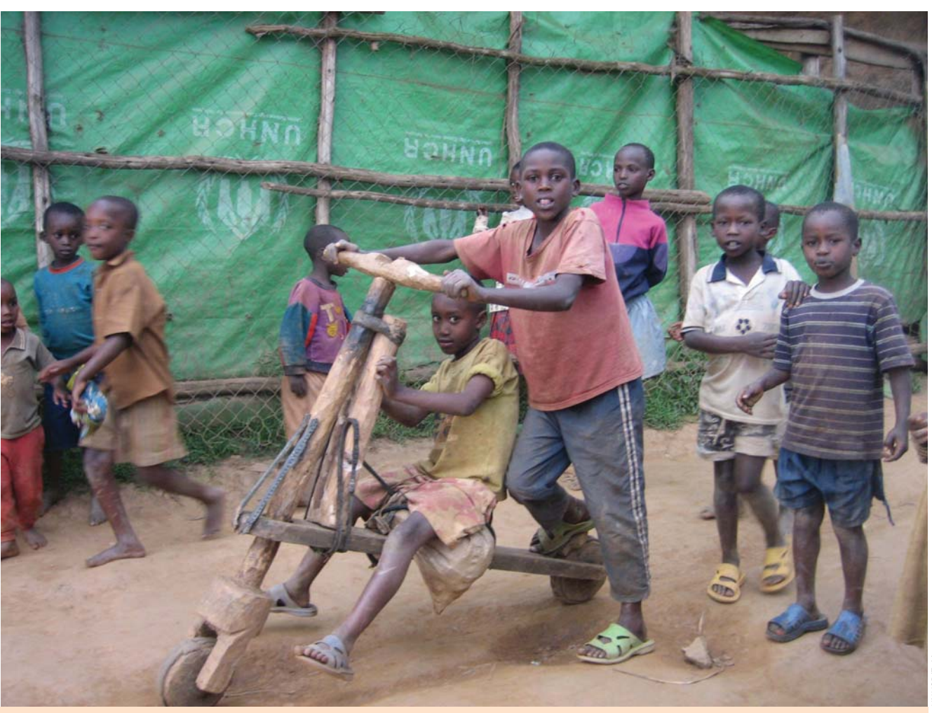
Rwanda. Congolese (DRC) refugee children at Kiziba refugee camp.

UNICEF helped provide drugs and medicines in the transit centres. More than 7,300 camp-based refugees benefited from counselling and testing services for HIV and AIDS. Some 260 refugees, of whom 65 per cent were female, received anti-retroviral treatment.