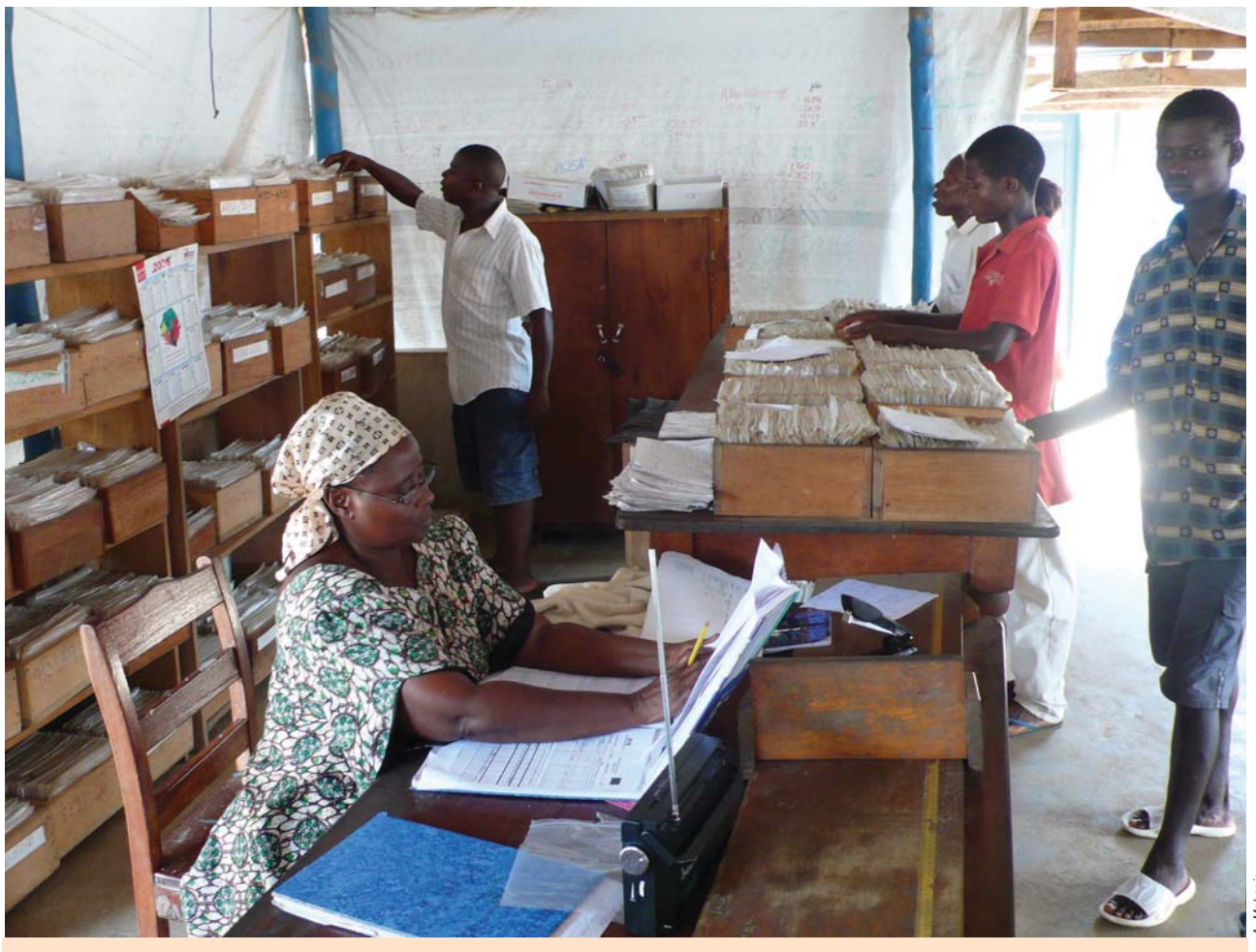
Health clinic for Liberian refugees in Tobanda camp, Kenema.

The Government has not been able to fulfil its assurances that all refugees would be given access to cultivable land. Many refugees in urban areas rejected opportunities for local integration, focusing instead on the prospect of resettlement. Though the Refugee Bill formally embraces local integration as a durable solution for refugees, it does not contain provisions for the granting of residence or citizenship.