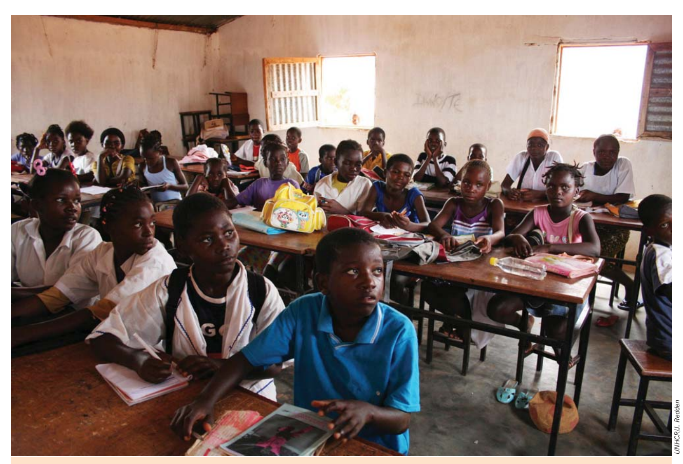
This school, initially for Congolese refugees (DRC), has been incorporated into the Angolan state school system and now welcomes both refugees and former Angolan IDPs.

Legal assistance: Most returnees were issued with identity cards upon return, and 143,270 returnee children were registered and provided with free birth certificates. All asylum-seekers who arrived in 2007 were registered and issued with identity documents. Legal Aid and Reintegration Centres gave free legal assistance to thousands of asylum-seekers and refugees. The centres facilitated the release of those detained, prevented refoulement and helped asylum-seekers to appeal their cases. Furthermore, UNHCR encouraged returnees to vote in the upcoming elections, resulting in more than 80 per cent being registered in Zaire and Uige provinces.