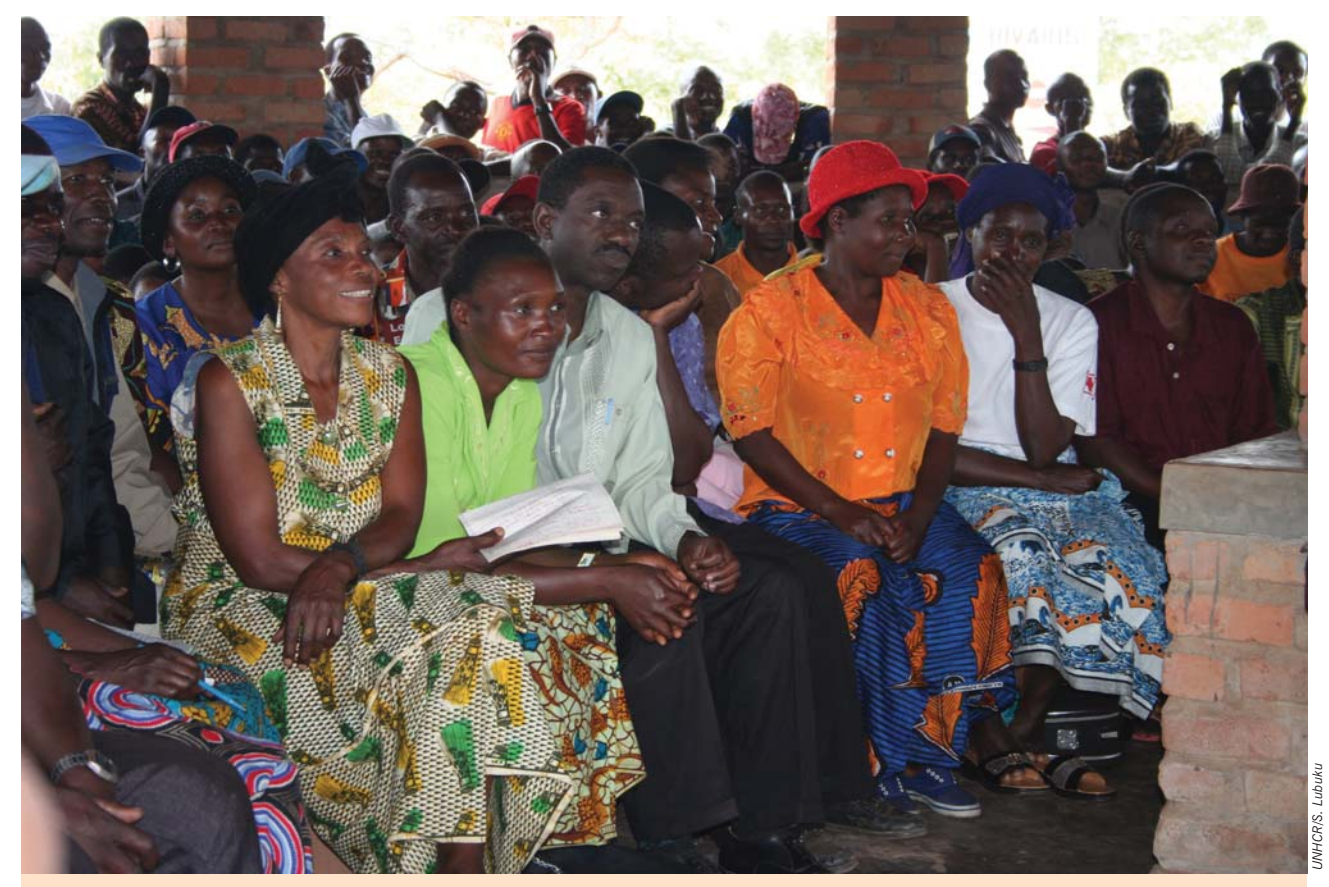
Congolese refugees in Mwange camp meet with UNHCR and government officials.