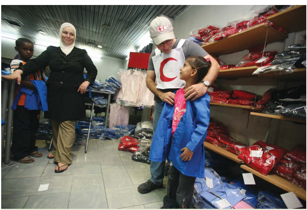
A Red Crescent volunteer helps a young Iraqi find a school uniform in the right size.

The number of returns to Iraq remained unclear. UNHCR helped some 100 returnees with transport and emergency assistance. The Office's 16 protection and assistance centres and five mobile teams offered legal and social assistance and dealt with some 36,000 cases. UNHCR also assessed the protection and assistance needs of IDPs, refugees and returnees inside Iraq and monitored their situation.