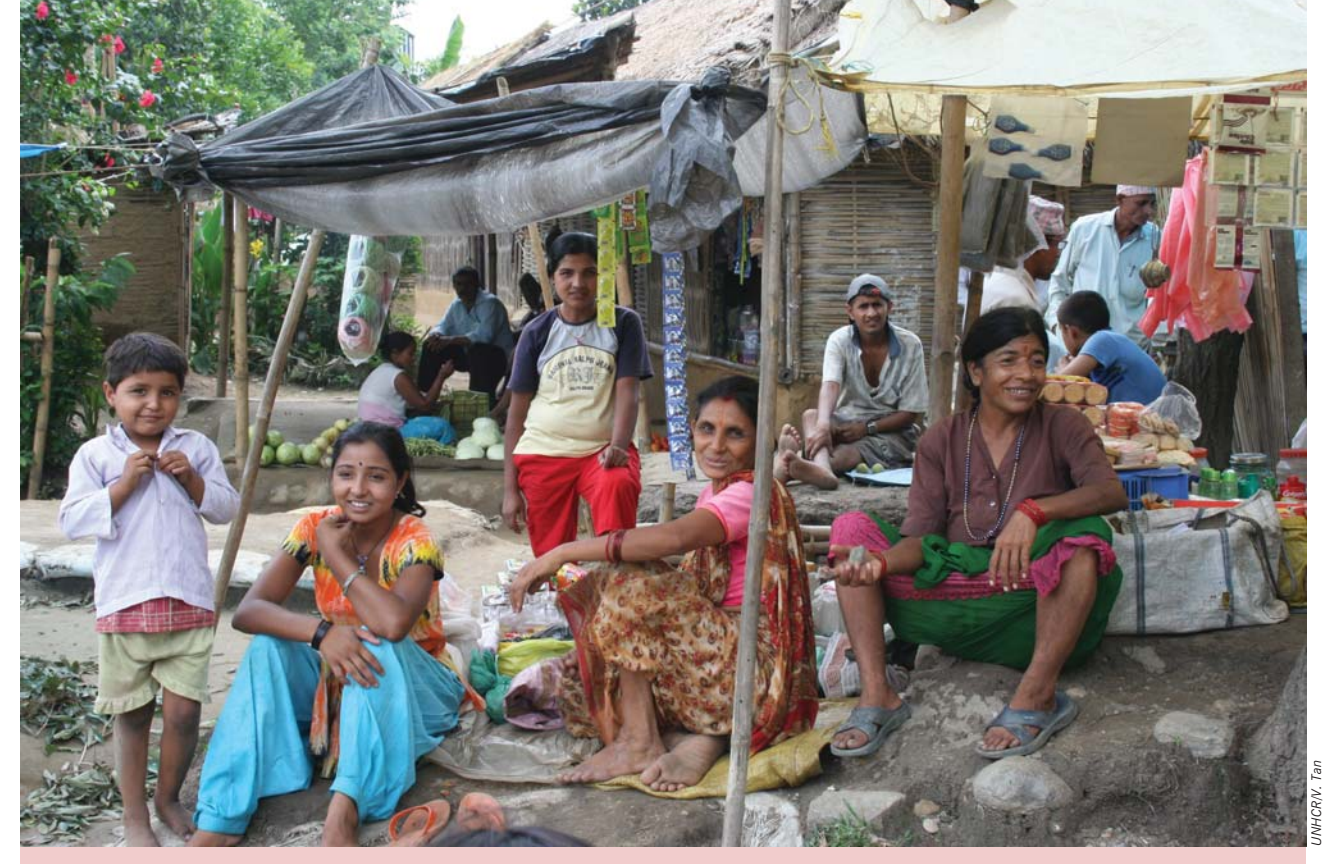
Market in the Goldhap camp, Nepal.

Health and nutrition: The quality of health facilities was improved by renovations and the creation of private areas for counselling and testing, as well as obstetric consultations. Drugs, updated diagnostic equipment, furniture and anti-infection supplies were provided to Primary Health Care centres. Two ambulances and two referral vehicles were put at the disposal of the Association of Medical Doctors of Asia-Nepal (AMDA), one of UNHCR's implementing partner, and emergency ambulance services were provided to refugee patients in need.