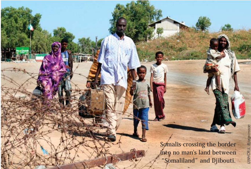
Somalis crossing the border into no man's land between "Somaliland" and Djibouti.