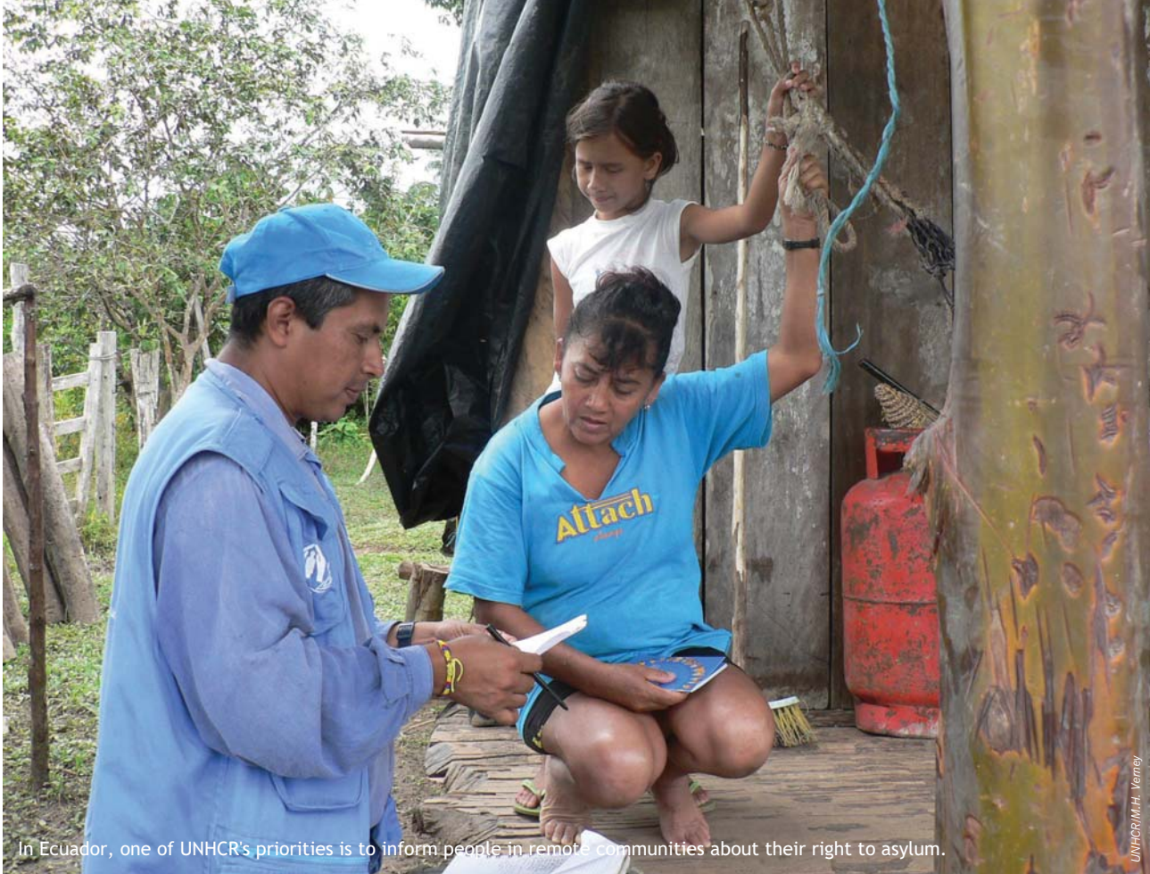
In Ecuador, one of UNHCR's priorities is to inform people in remote communities about their right to asylum.