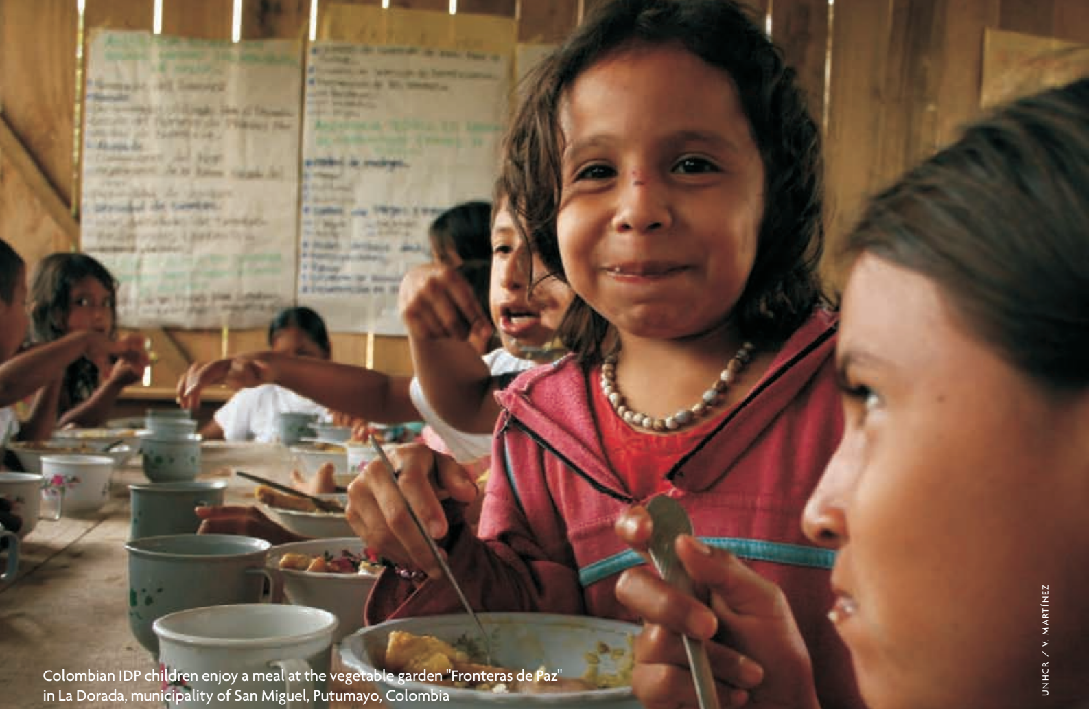
Colombian IDP children enjoy a meal at the vegetable garden "Fronteras de Paz" in La Dorada, municipality of San Miguel, Putumayo, Colombia