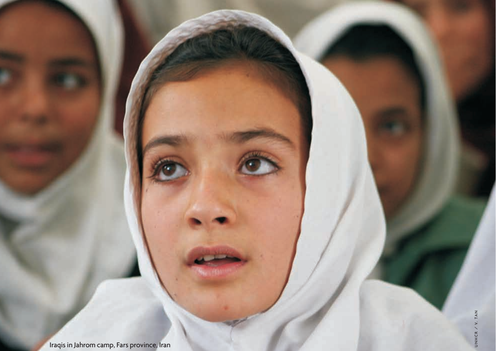
Iraqis in Jahrom camp, Fars province, Iran