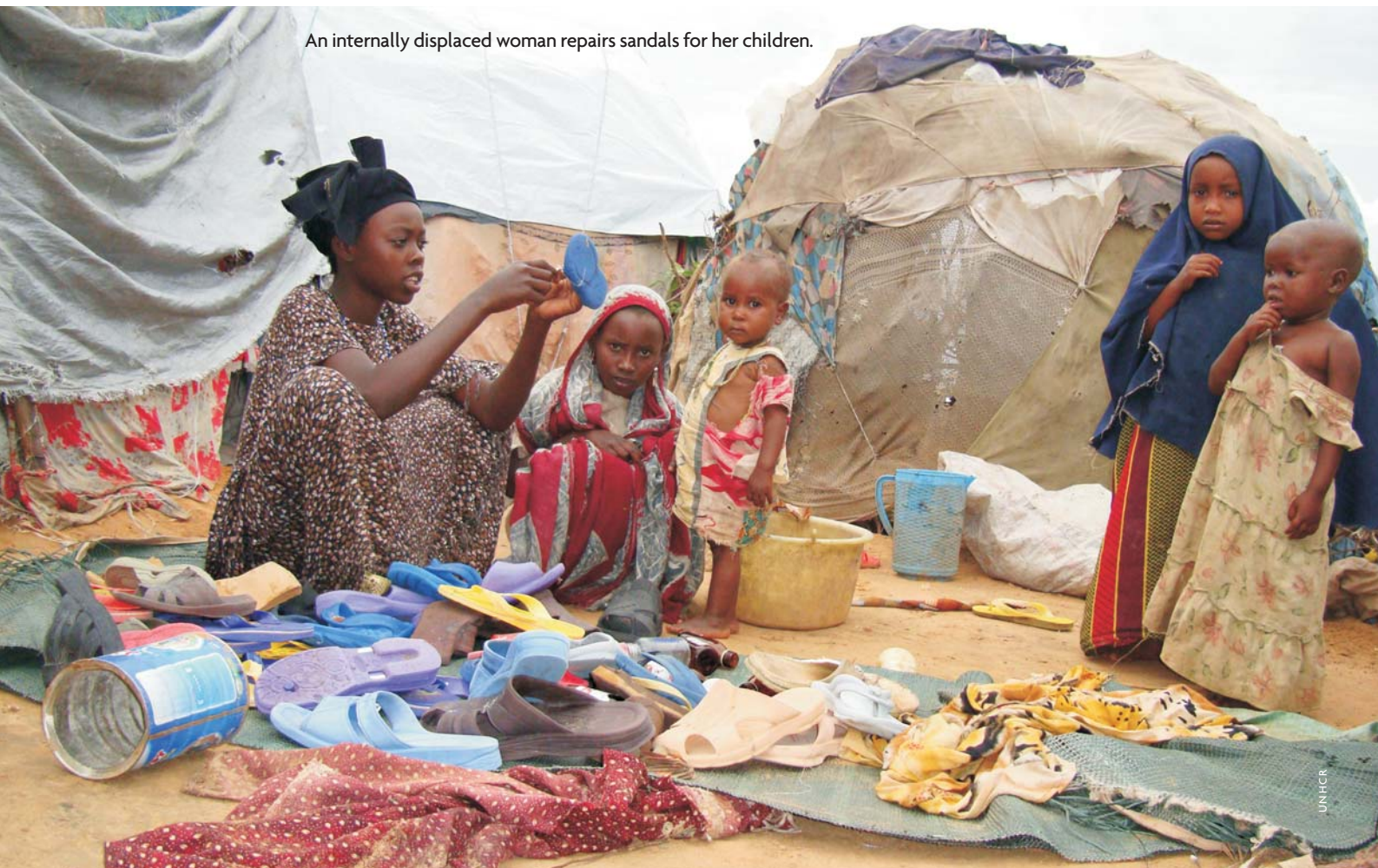
An internally displaced woman repairs sandals for her children.