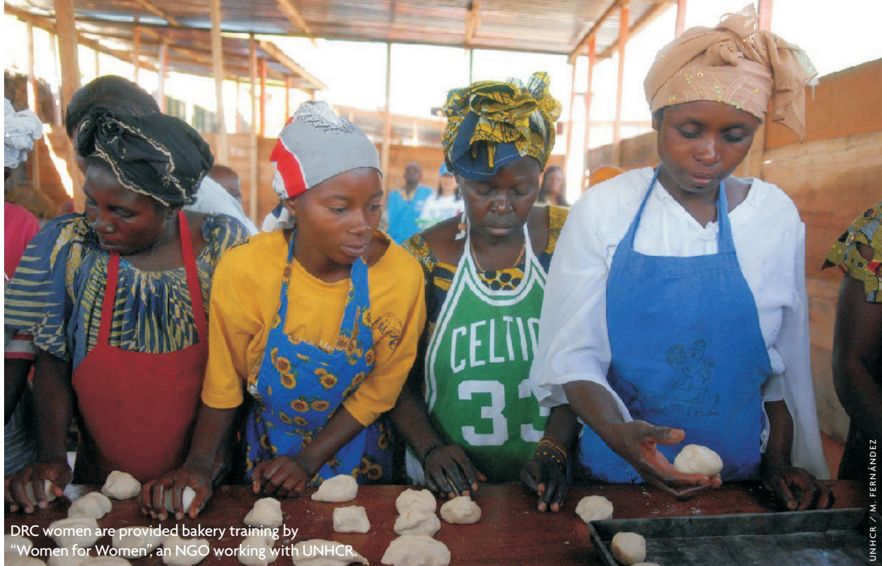
DRC women are provided bakery training by “Women for Women”, an NGO working with UNHCR.