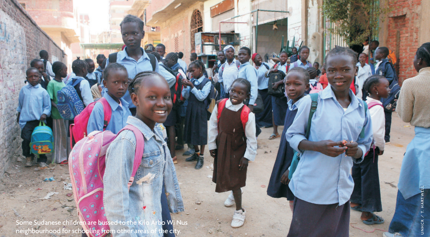
Some Sudanese children are bussed to the Kilo Arbo Wi Nus neighbourhood for schooling from other areas of the city.