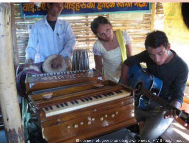
Bhutanese refugees promoting awareness of HIV through music