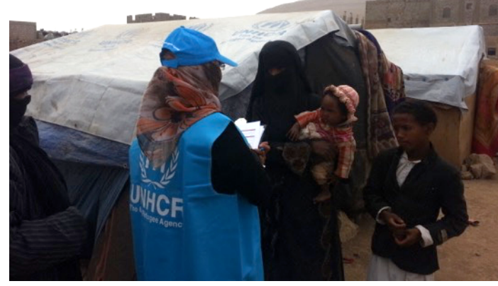
UNHCR conducting protection monitoring of IDPs in spontaneous settlements in Raidah, Amran governorate, which UNHCR has provided with emergency shelter kits.