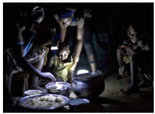
Parents prepare meals for the children in Liberia.

teachers hired by Save the Children. There are at present 3,399 refugees in Bahn camp.