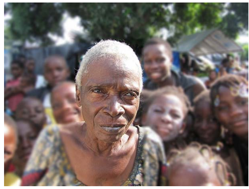
Women and children were among the most touched by the conflict, (UNHCR Abidjan/staff/2011)