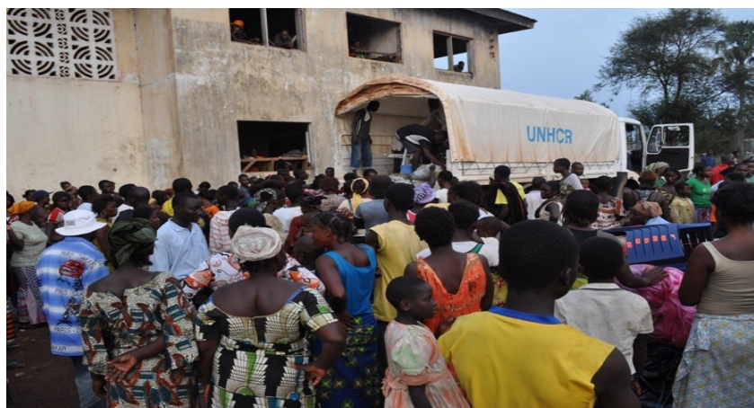
Transit center, Maryland, Liberia