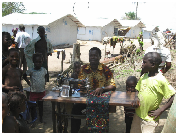
Livelihood activities in Bahn camp, Nimba county, Liberia

There are 838 registered Ivorian asylum seekers in Mali as of 26 April. The reporting period saw an increase of 134 new asylum seekers. During the reporting period, 203 Ivorians entered Mali through the Zégoua entry point. When asked for the motive of their journey, all identified themselves as traders who faced food shortages in Côte d’Ivoire and came to buy supplies in Mali. WFP bought 9,000 metric tons of rice of a value of 3 billion CFA francs in Mali for Côte d’Ivoire. An airlift has been established to provide essential assistance to both the IDPs in Côte d’Ivoire and the Ivorian refugees in Liberia.