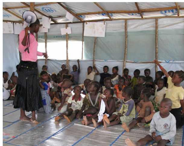
School in Bahn camp, Nimba county, Liberia

130-170 persons/day are crossing the Ghana border since the arrest of Gbagbo on 11 April. New arrivals claim to be fleeing gunmen seeking out Gbagbo supporters.