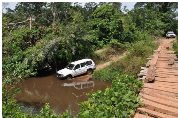
Road to the PTP camp, Grand Gedeh, Liberia

UNHCR and WFP offices in Man conducted rapid joint assessments in the prefectures of Moyen Cavally, Dix-Huit Montagnes, Bafing, Denguélé, Worodougou and Haut Sassandra. Some IDPs want to return home as soon as possible, while others want assurances of