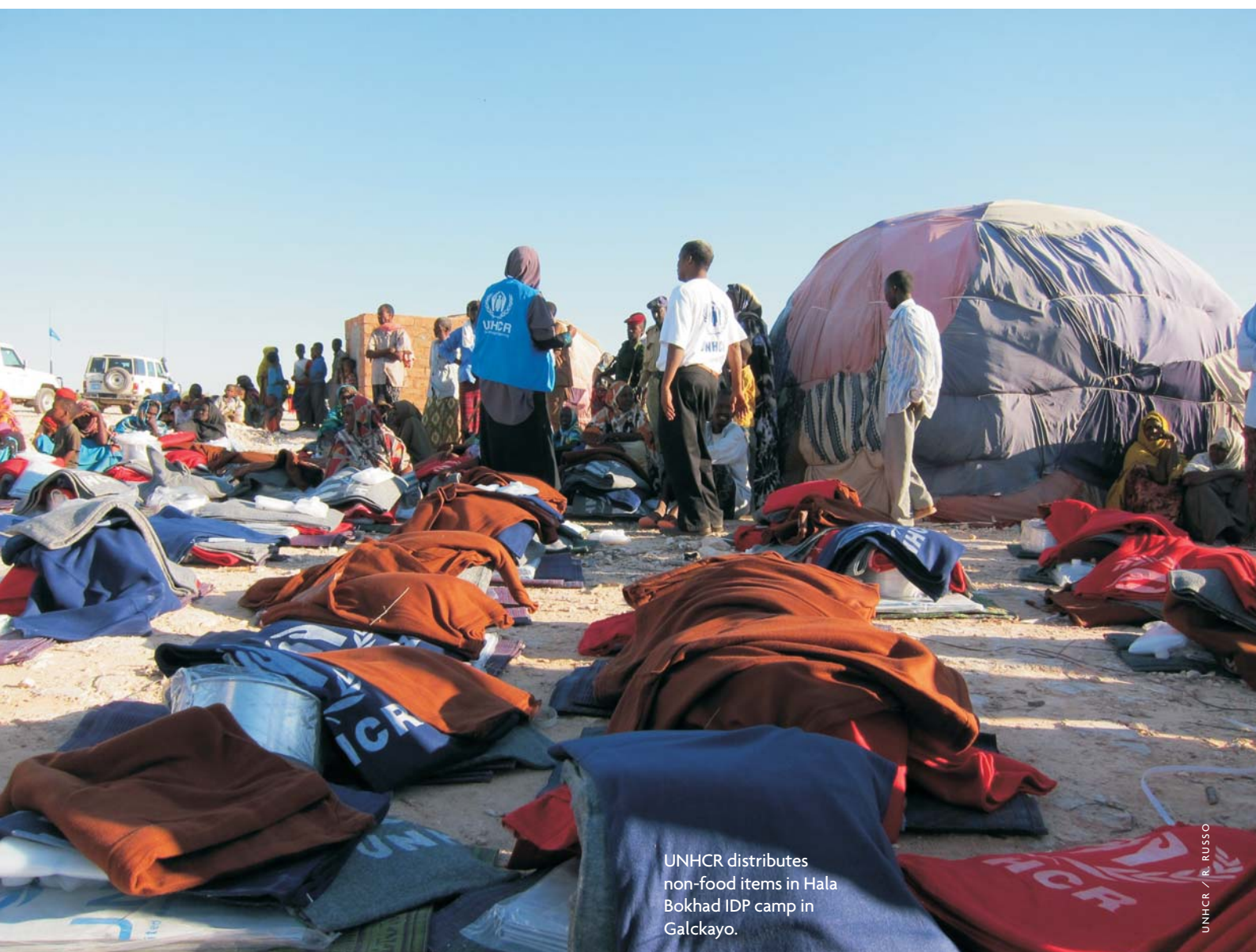
UNHCR distributes non-food items in Hala Bokhad IDP camp in Galckayo.

Humanitarian access, particularly in the South-Central region, continued to be a major constraint. The security situation prevented implementation, monitoring and