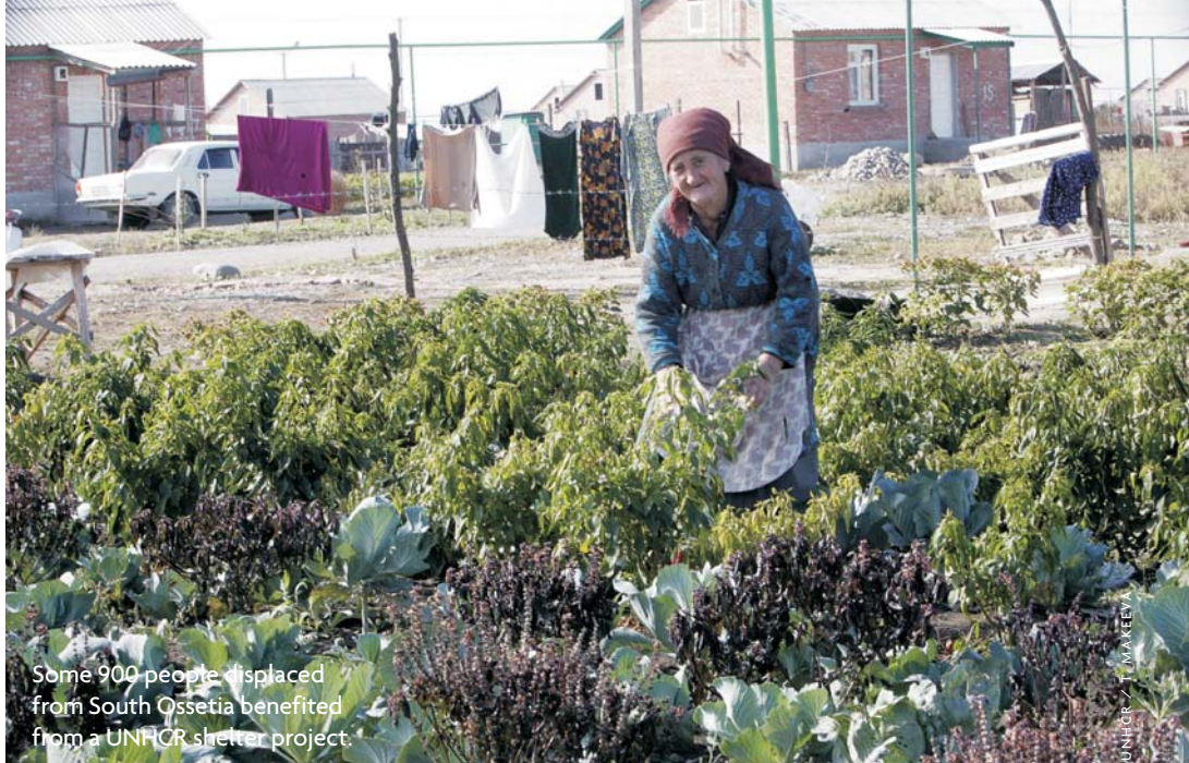
Some 900 people displaced from South Ossetia benefited from a UNHCR shelter project.

in administrative procedures had received favourable decisions and an additional 1,200 cases were positively adjudicated through the court system.