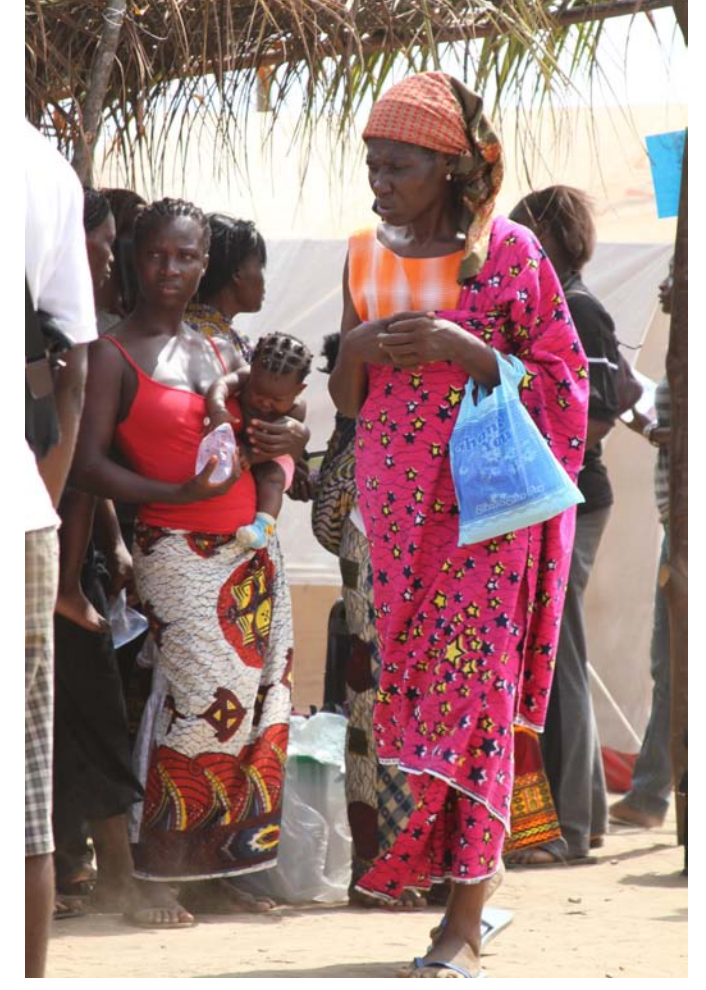
Refugee women, Ampain Camp, Ghana.

While the total number of Internally Displaced Persons (IDPs) in Côte d'Ivoire is estimated by the Humanitarian Country Team to be close to 500,000, the latest figure for IDPs in western Côte d'Ivoire stands at 43,485 in 16 sites. On 17 June, the first returns of 481 IDPs from Danané to Teapleu took