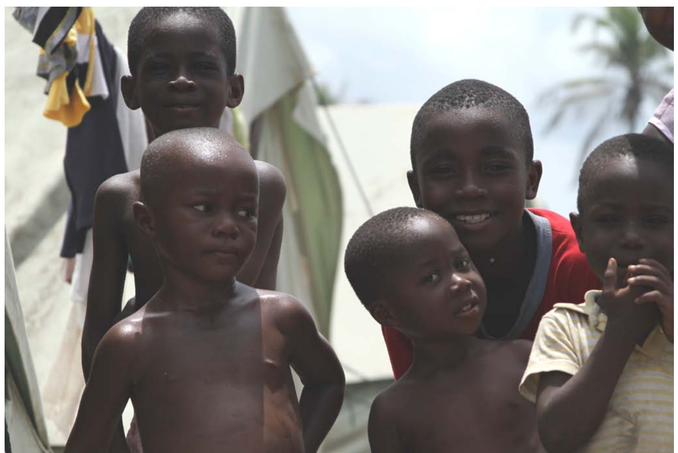
Refugee children, Ampain Camp, Ghana