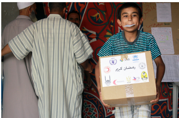
Distribution of Ramadhan food package to Libyan refugees in Tataouine.