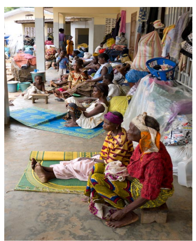
IDPs at the Duékoué Catholic Mission, Cote d'Ivoire.

On 28 and 29 July, a high-level delegation of Government and United Nations representatives visited western CIV to assess the humanitarian situation and find ways to foster the rapid return of displaced or exiled persons.