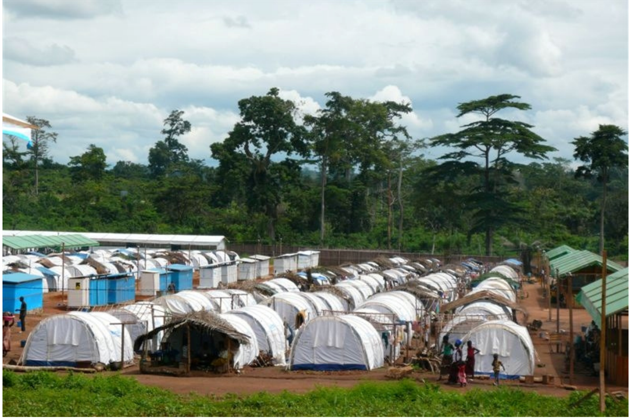
Nahibly IDP site, Western Côte d'Ivoire (UNHCR/Hofbauer/ 2011)