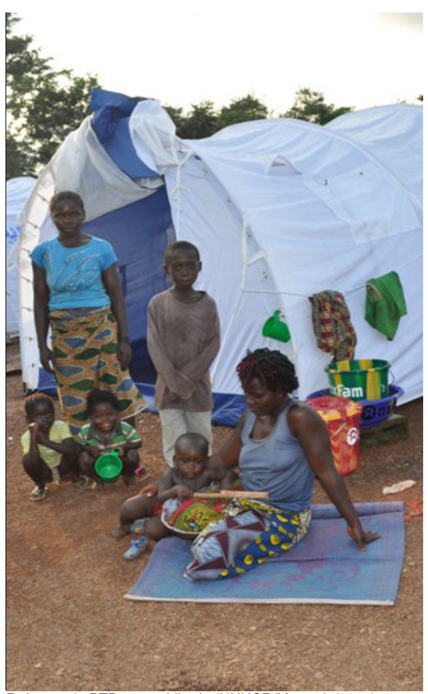
Refugees in PTP camp, Liberia

Between 15 and 16 September 2011, an armed attack took place at Ziriglo and Nigré villages in Moyen Cavally region, 36 km from the provincial town of Tai and 7 km from the Liberian border. According to the Ivorian Ministry of Defense, 23 persons were killed in the attack, including 22 civilians and one member of the Forces Républicaines de Côte d'Ivoire (FRCI), and 45 houses were set ablaze. Allegedly, the attack was carried out by suspected Ivorian militia and Liberian mercenaries.