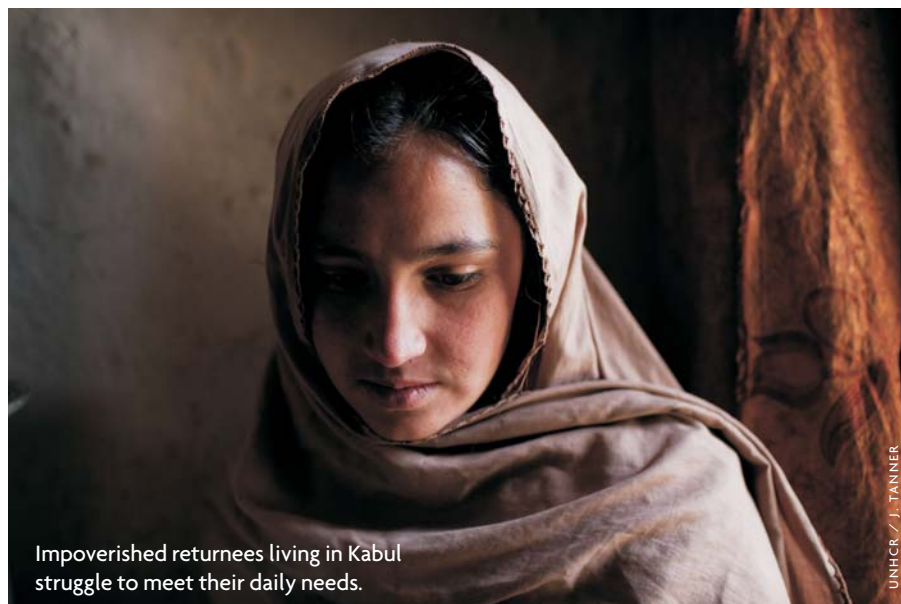
Impoverished returnees living in Kabul struggle to meet their daily needs.

More than 5.7 million refugees – 4.6 million of them with UNHCR assistance – have returned to Afghanistan since 2002, increasing the population of the country by some 25 per cent. UNHCR has conducted an assessment in 2011, to gauge the level of reintegration achieved by the returnees. The survey, which covered both urban and rural areas, has shown that more than