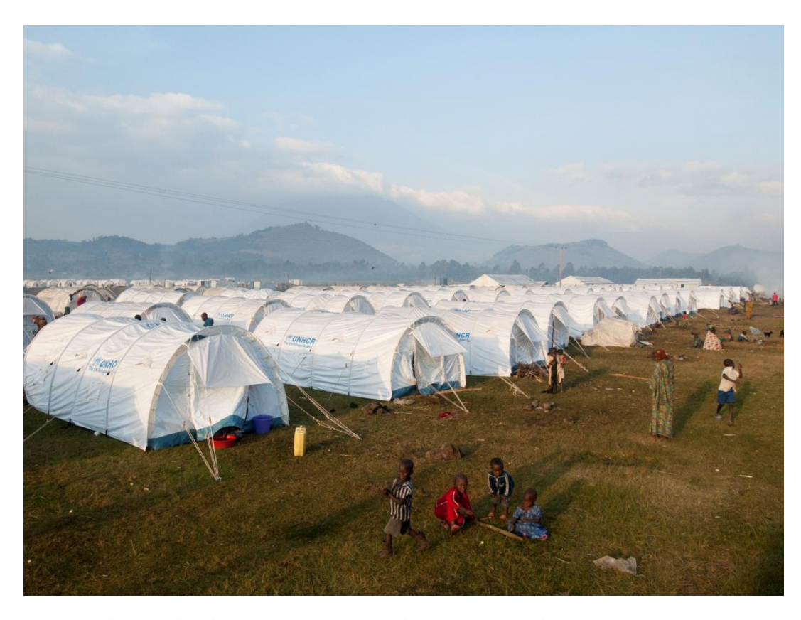
A view of the Nyakabande transit centre in Uganda/ UNHCR/ M. Sibiloni/ July 2012

Initially, the refugees were transported to existing refugee settlements in Nakivale and Oruchinga. In addition, the Government of Uganda opened a new settlement, Rwamwanja, in Kamwenge District. The site was a dilapidated former refugee settlement used formerly to accommodate refugees from Rwanda. UNHCR and the Office of the Prime Minister, in charge of refugee affairs, have started to rehabilitate the existing basic infrastructure and services. By the end of August, more than 24,000 refugees had been transferred to the settlements in 23 convoys, mostly to Rwamwanja, where they are allocated small plots of land.