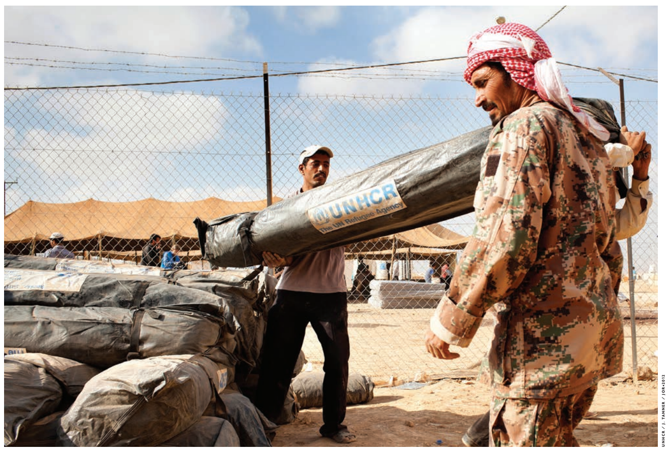
Syrian refugees collect tents at a distribution centre in Za'atri refugee camp, Jordan.

NHCR HEADQUARTERS staff, located in Geneva, Budapest and other regional capitals, work to ensure that the Office carries out its mandate in an effective, coherent and transparent manner. In 2013, Headquarters divisions and bureaux will continue to provide leadership and support for field operations, including through their responsibilities for the following key functions: