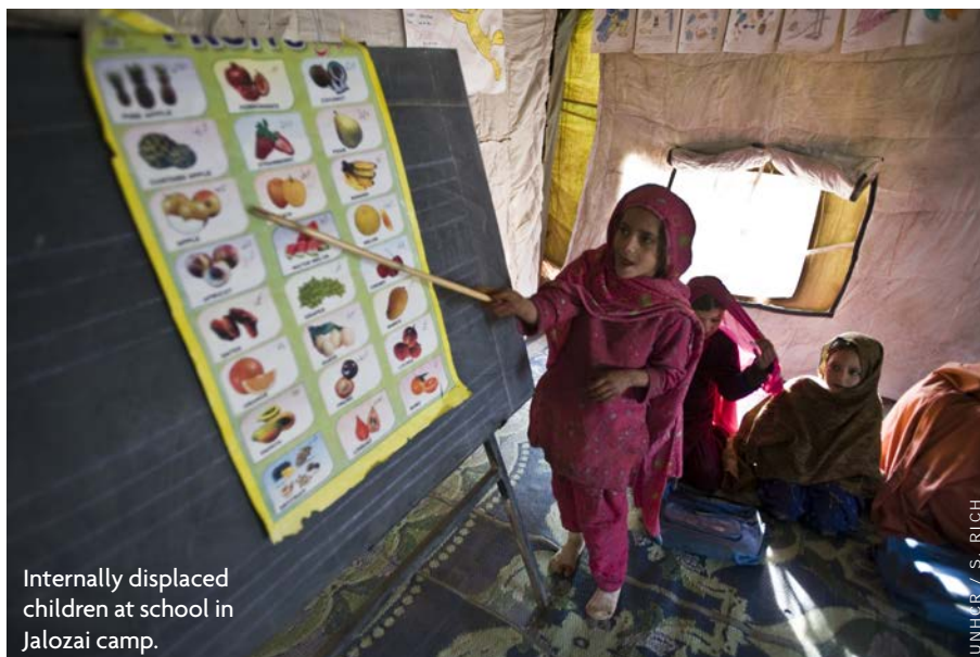
Internally displaced children at school in Jalozai camp.