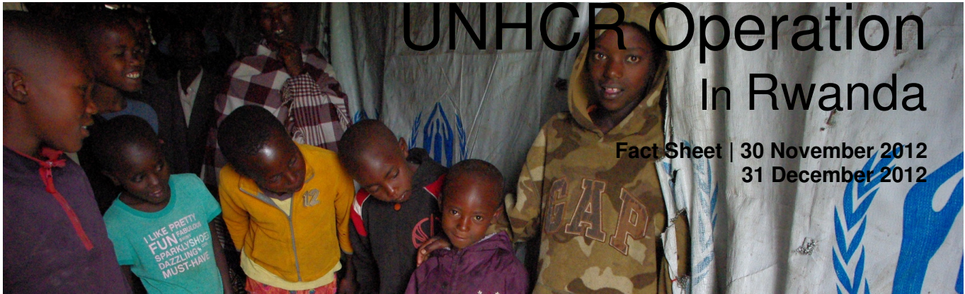
Children at Nkamira Transit Centre awaiting transfer to Kigeme Camp, after fleeing from the November fighting in Eastern DRC