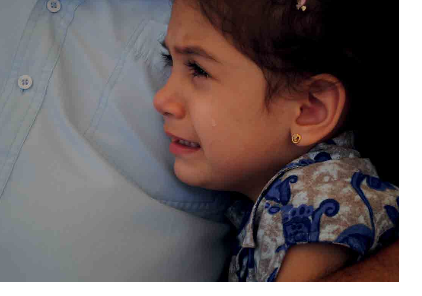
Iraqi refugee child at the Restart centre for rehabilitation of victims of torture and violence taken during a trip to Tripoli.

Mental health and psychosocial problems may affect functioning in a variety of ways – for example, an individual experiencing symptoms of depression such as lethargy, sleeplessness and loneliness may be less likely to take part in community activities, or a mother feeling frustrated, anxious and hopeless may be less likely to be able to perform important care practices for her child. Efforts to promote self-reliance and livelihoods may be undermined if individuals and families are less likely to engage in such activities due to unmet mental health and psychosocial needs. Therefore, it is evident that symptoms of mental health and psychosocial problems can significantly impact individual, family and communal well-being.