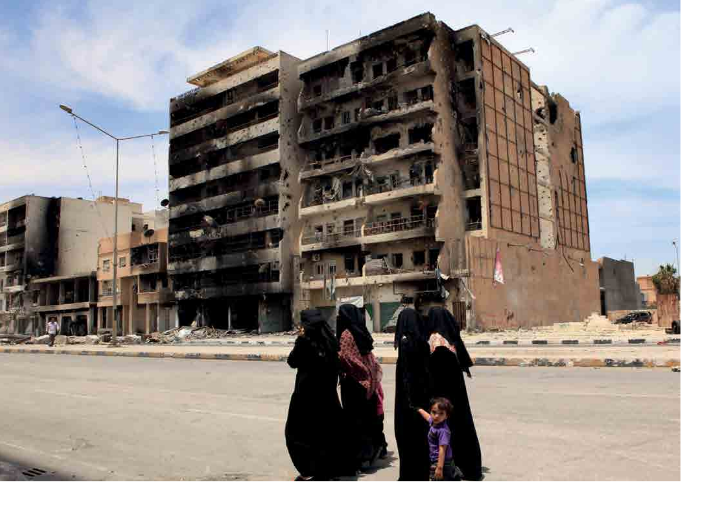
Libya / Misrata / Women and a child from Misrata walk through Tripoli. © UNHCR/ H. Caux / June 1, 2011

framework, and assess the collective humanitarian response [see Textbox 7 below]. For example, a respondent from an international agency cited an example of all agencies working on MHPSS activities in a humanitarian situation meeting together to map their activities against the Intervention Pyramid, and realising that the response was heavily skewed towards clinical responses, prompting a shift in allocation of resources and attention.