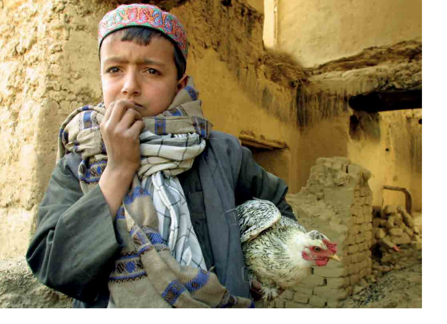
Afghanistan / Returned IDPs / An Afghan IDP returning from the "Russian Compound" in Kabul to land in the Shomali Plain stands in the wreckage of what was once his home. 3 March 2002