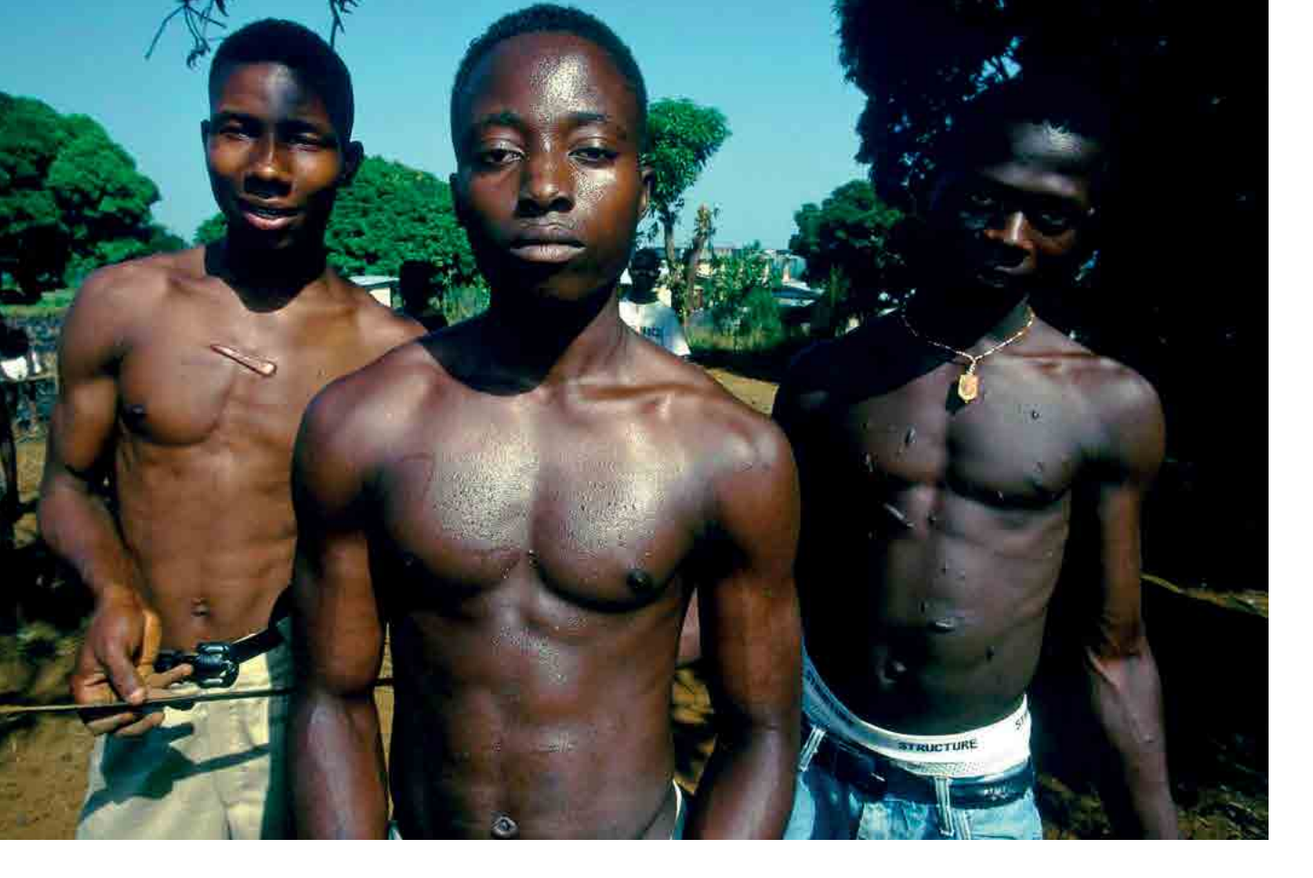
Sierra Leone / IDPS / Former child soldiers in rehabilitation / CAW (Children Affected by War) / Freetown © UNHCR / C. Shirley / December 1999

snapshot: Outreach volunteers. As such, recognition of the interconnections between protection and MHPSS, and integration of these activities, can concretely improve services. However, at the moment, the widespread understanding of protection activities and MHPSS as disconnected leads to a "complete split between the work of the protection unit managing violence cases and the work of the psychosocial unit managing psychosocial issues." The separation of protection and MHPSS approaches and activities is not just an issue of definition or language, but has concrete impacts on quality of services.