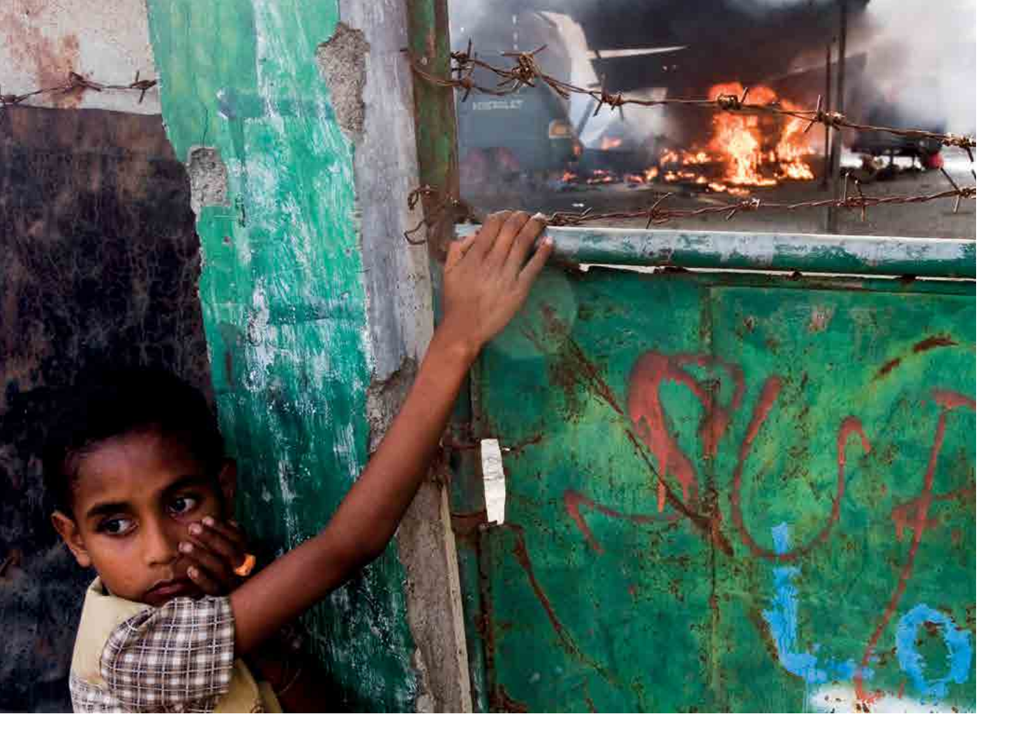
Timor-Leste / IDP emergency / A boy watches as vehicles burn as a result of arson in Dili. © UNHCR / N. Ng / June 2006

UNHCR works in multiple spheres in which MHPSS issues are fundamental. There are a number of areas of UNHCR's work that are directly connected with MHPSS approaches and interventions, and below policy guidelines in the areas of SGBV, child protection, education, and community-based approaches are analysed.