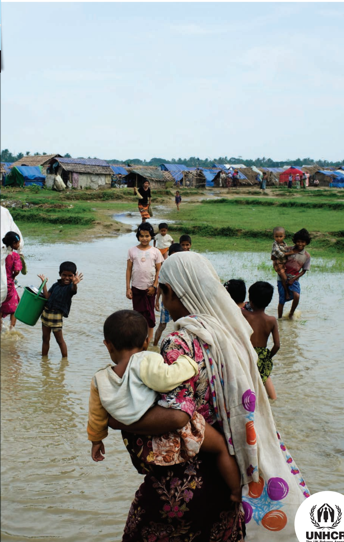
IDPs wade through flood water near the Hmanzi Junction makeshift site in Rakhine State, Myanmar (May 2013)