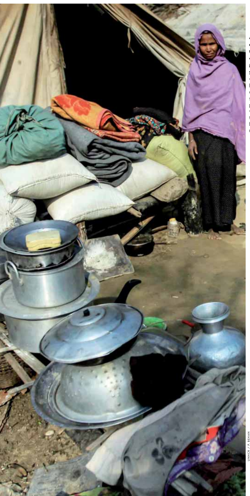
An IDP woman outside her tent in the remote river village of Inbargyi in Myanmar's Rakhine State. Locals say the village was attacked by a large group of people, forcing several thousand people to flee the violence and leaving those who remained behind in desperate need of food.

The analysis of demographic characteristics, such as sex and age, as well as information on the types of locations of populations, is discussed in Chapter V . This discussion also includes a historical demographic analysis of refugee data and how this population compares to the demography of its hosting countries.