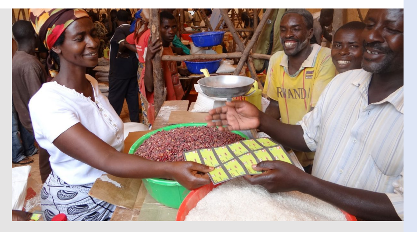
Burundi / Food voucher system in Gasorwe camp which allows refugees to choose their own food items while contributing to the local economy. / UNHCR / I. Wittorski / June 2013

DPSM is coordinating efforts to expand the use of cashbased interventions in UNHCR operations, working closely with WFP and other strategic partners. The increasing urbanization of displacement and new technologies have opened up possibilities for the delivery of cash-based assistance, which is having a transformative impact on humanitarian assistance. The agency is developing up-to-date systems, tools and capacities to ensure that cash-based interventions enhance protection and achieve impact, while ensuring integrity and visibility for donor contributions.