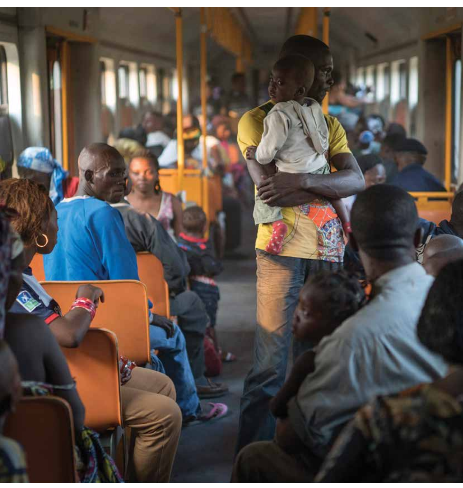
Angolan refugees, some of whom had been living in exile in the Democratic Republic of the Congo for up to 40 years, journey back to their homeland by train from Kinshasa. Over the course of 2014, 126,800 refugees returned to their country of origin worldwide. This figure was the lowest level of refugee returns since 1983.