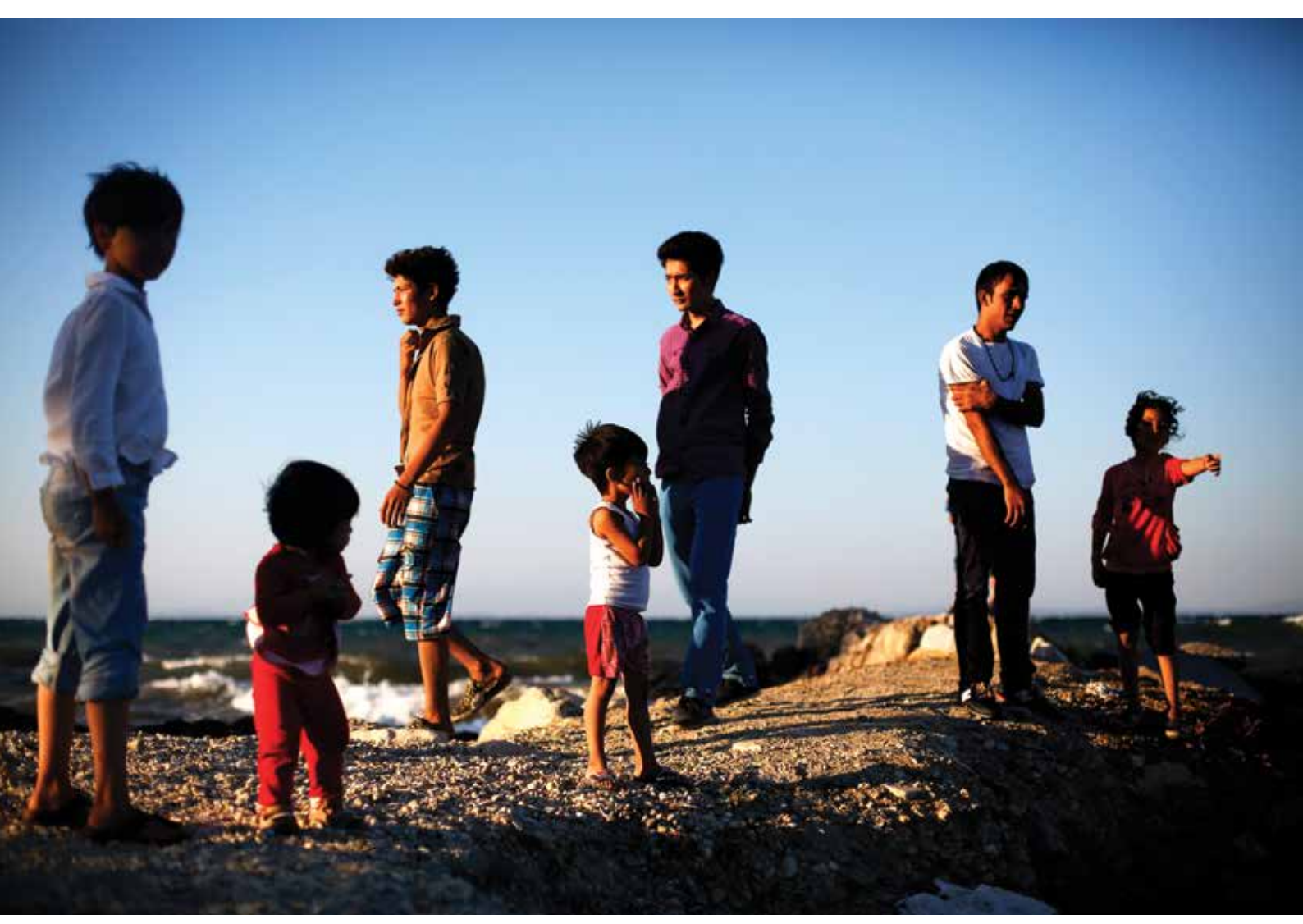
An extended family of Afghan asylum-seekers, newly arrived on Greece's Lesvos Island, wait on the beach for the police to register them. Ongoing conflict in places like Afghanistan, Somalia and the Syrian Arab Republic, leaving millions of people in protracted displacement and increasingly difficult situations, is forcing many to take to the seas on dangerous journeys to seek asylum in Europe.

operations are requested to report on the 'extent to which social and economic integration is realized'.