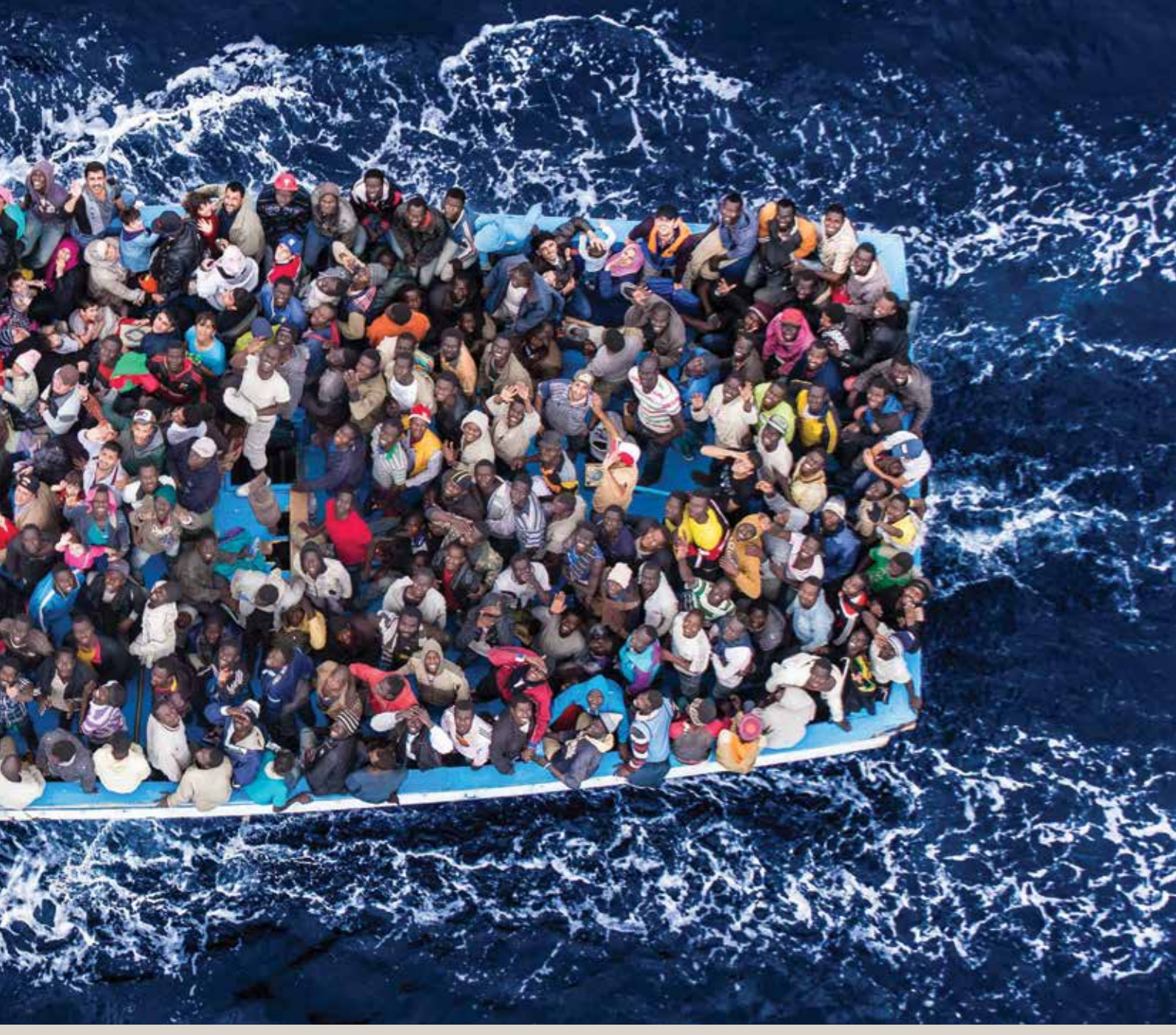
Hundreds of refugees and migrants crowded on a fishing boat are pictured moments before being rescued by the Italian Navy under its former "Mare Nostrum operation" in June 2014. They are among the lucky ones who survived the dangerous sea journey on the Mediterranean.