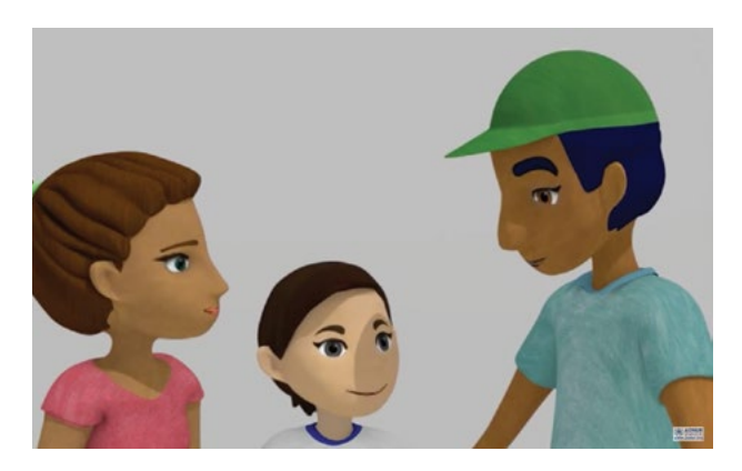
This video is available at: <a href="https://youtu.be/93OgdoQBMnE">https://youtu.be/93OgdoQBMnE</a>.

According to the standard procedure, after viewing the video, the child is asked to explain in his/her own words the video's content. The OPI then clarifies any issue to the child and provides an overview of the asylum procedure. The OPI must communicate to COMAR in written form, and no later than 72 hours, whenever a child is interested in lodging an asylum claim, or if a child is considered to be in need of international protection as a refugee. In the latter case, COMAR must contact the child to learn more about his/her position and initiate asylum procedures. The National System for Integral Family Development (DIF) is also expected to participate in these matters, accompanying the child and providing emotional support.