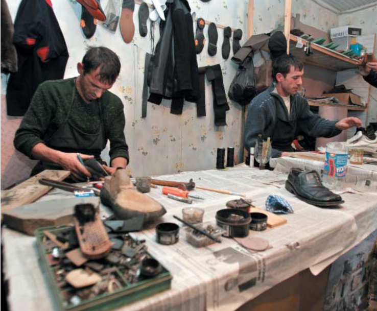
This shoemaker shop, which produces and repairs orthopedic footwear for the disabled, is one of UNHCR's 54 quick-impact projects for returnees in Chechnya.

UNHCR's protection is essential to ensure that the rights of IDPs and returnees are respected. Humanitarian access must be fully guaranteed if the Office is to protect and assist the displaced in the region. In cooperation with the concerned Governments, local integration needs to be considered for those IDPs in Ingushetia who do not wish to return to Chechnya. Integration opportunities need to be maintained in North Ossetia-Alania for refugees from South Ossetia (Georgia).