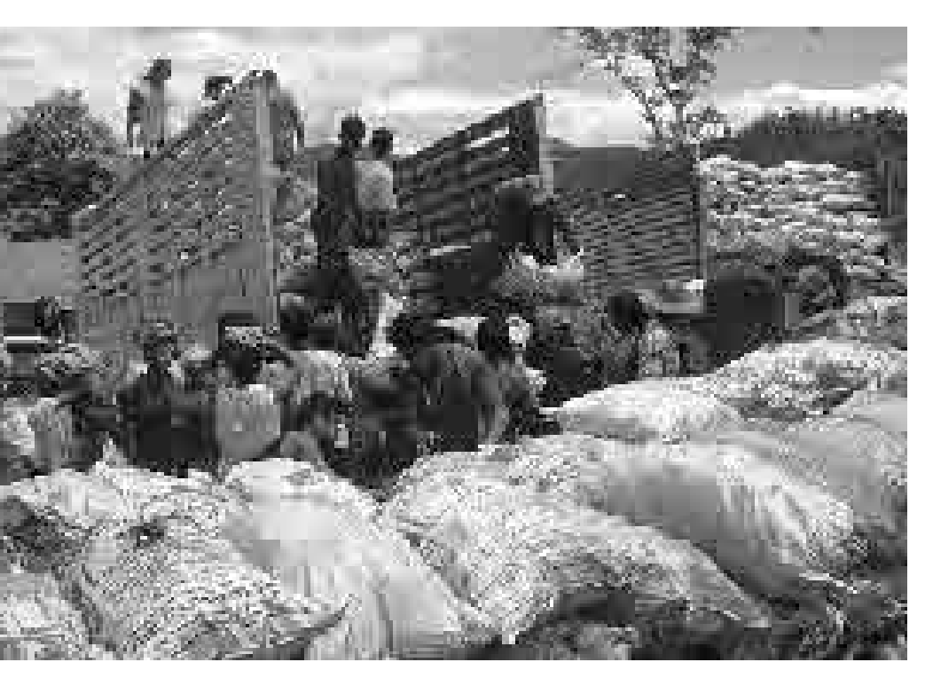
Thailand: Non-food items are stockpiled in the event that emergency supplies are needed. Refugees from Myanmar in Ratchaburi helping with storing the items.

to the refugee instruments. The interception of large numbers of asylum-seekers, mainly from the Middle East, on their way to Australia, increased Government reluctance to consider accession.