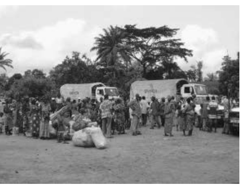
Sierra Leone: About 100,000 people have gone home since mid-2001. Here Sierra Leonean returnees arrive in their village.

The return of relative stability in the Republic of the Congo augurs well for the voluntary repatriation from Gabon of 17,555 Congolese refugees.