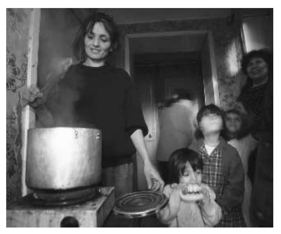
Refugees from Georgia are living in a rehabilitated building.

Income generation: Over 300 refugees and asylum-seekers in Moscow and St. Petersburg benefited from training opportunities in tailoring, design, sewing, hairdressing, cosmetics, batik, computer skills, and masonry. A job placement scheme initiated in Moscow and the greater Moscow region helped some 90 individuals find temporary employment in Moscow but could not yield long-term results due to the problems with documentation and registration. IRPs and IDPs continued to receive loans from a revolving fund created by UNHCR and managed by a local NGO (no longer requiring funding from UNHCR). Some 2,335 loans were approved in 2001.